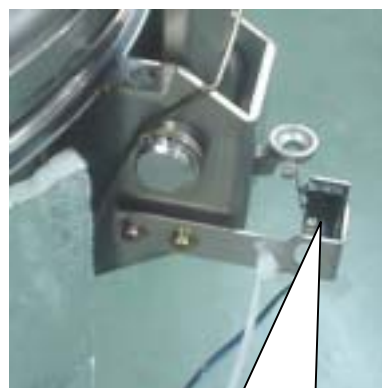
Right side hook micro switch

Most of cause, left side micro switch metal fixture or Right side micro switch metal fixture damaged by Shipping method or handling method.