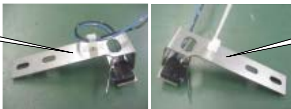
Bent this part