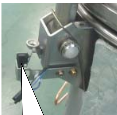
Left side hook micro switch